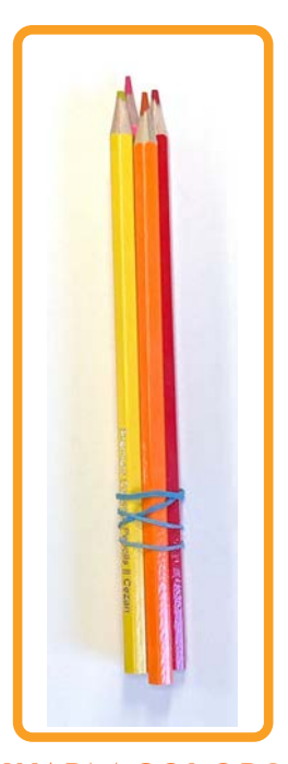
WARM COLORS are yellows, reds, pinks, and oranges!